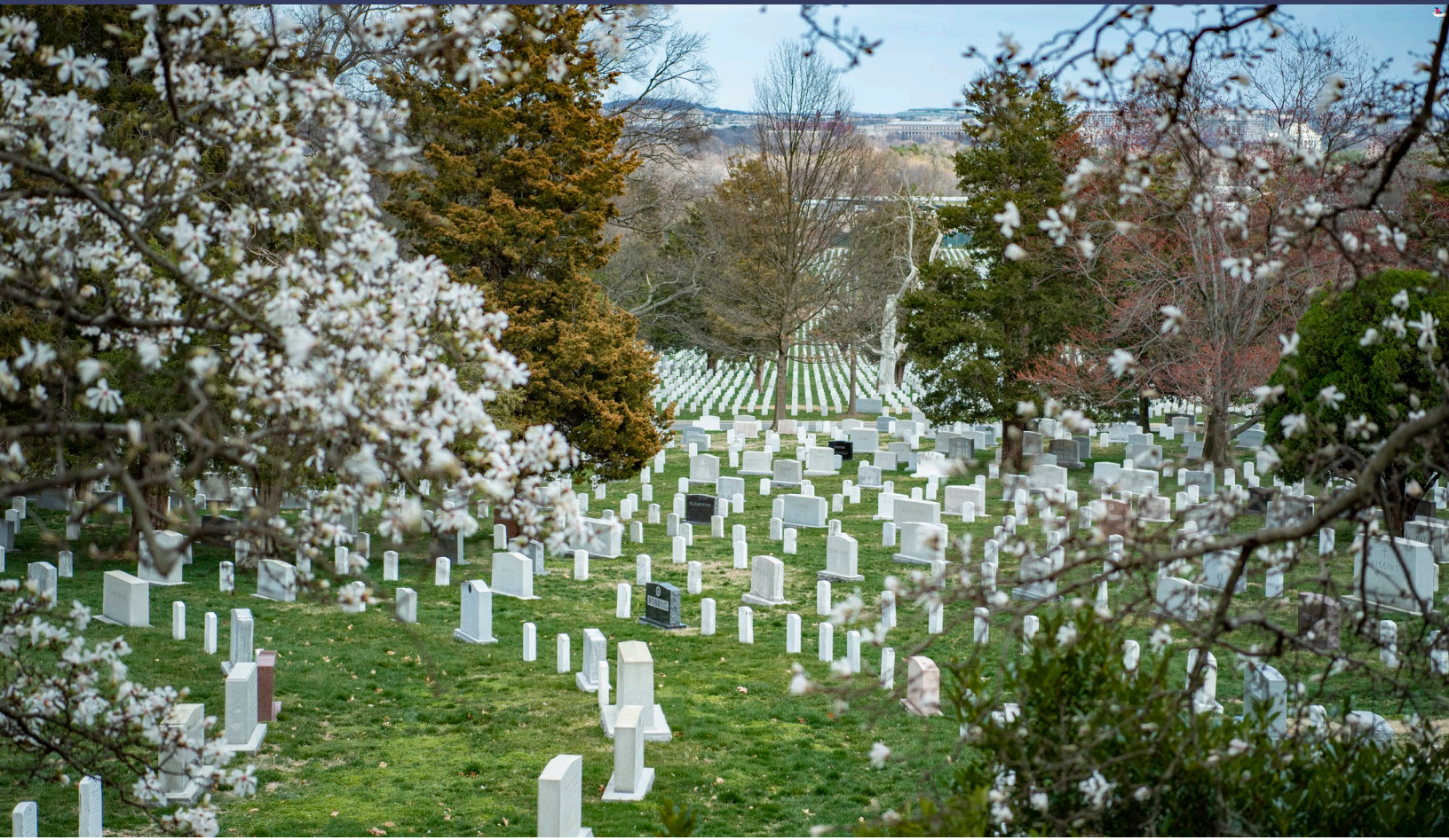
Overlooking Section 7 of Arlington National Cemetery.