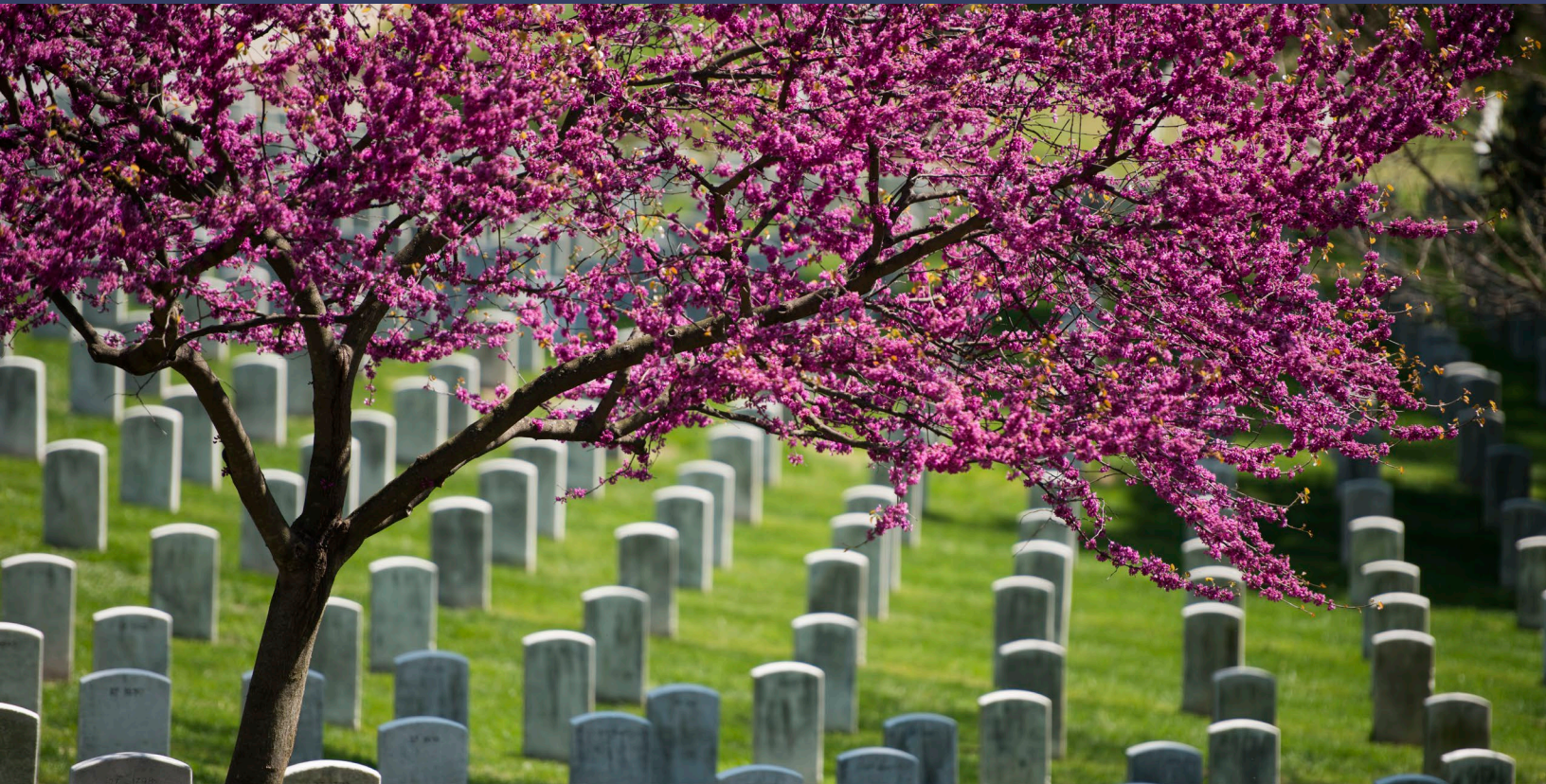
A redbud tree blooming in Section 27. (Arlington National Cemetery/Rachel Larue, 2016)