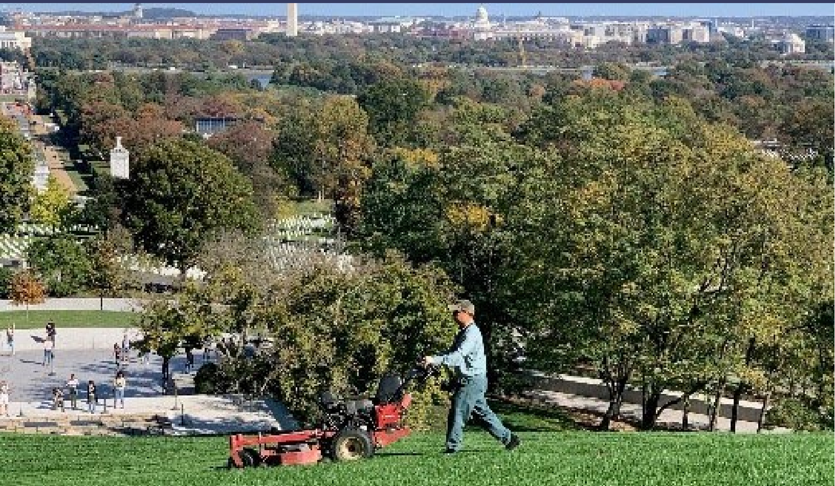
A maintenance man mows the grass at Arlington National Cemetery. (Arlington National Cemetery, 2019)