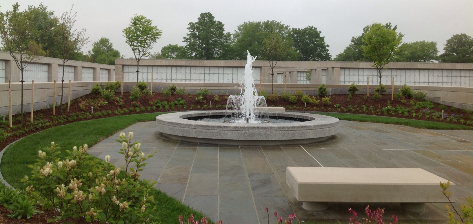
Plants surround Columbarium Court 9.