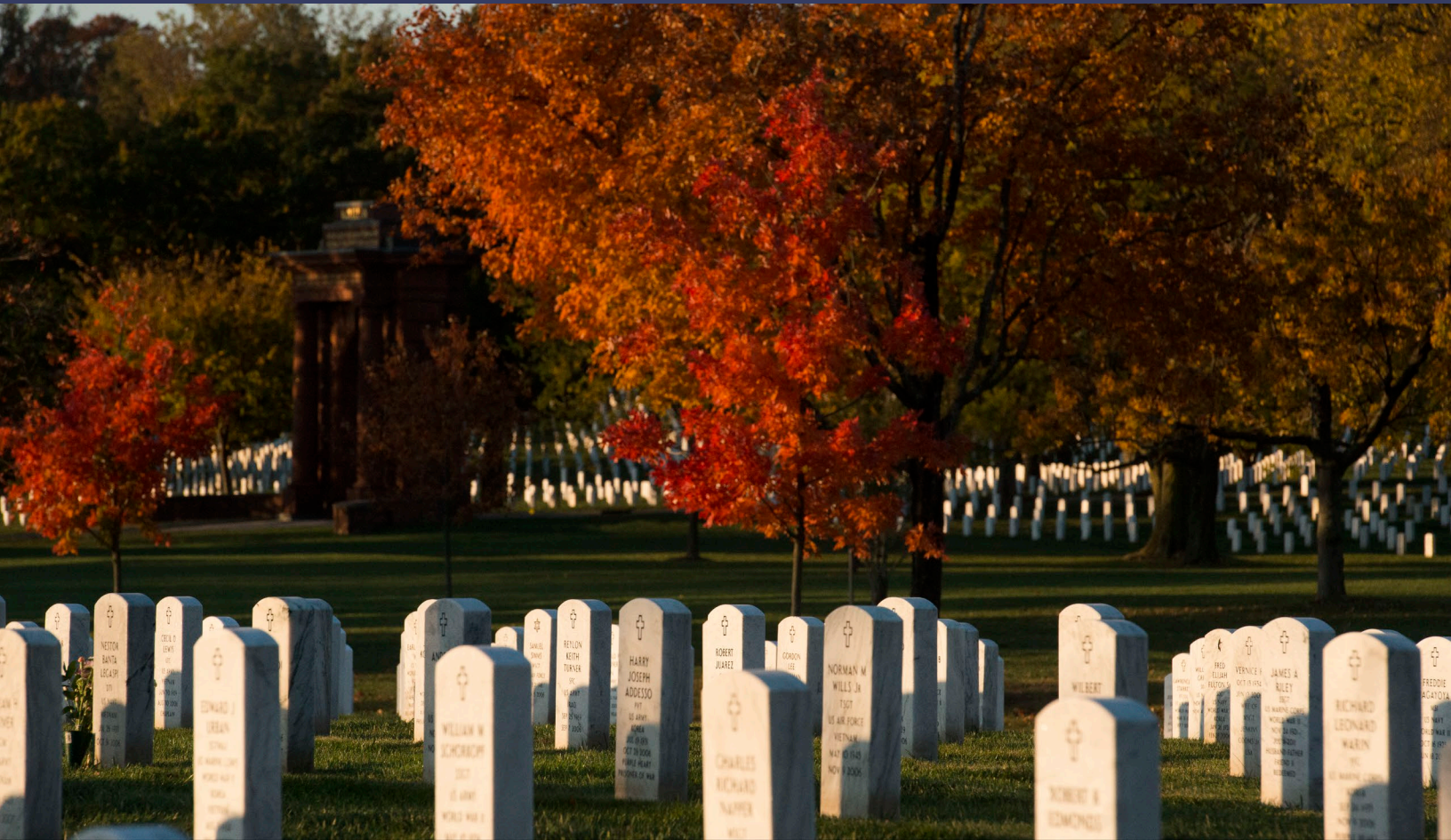
Autumn leaves nearby the McClellan Gate.