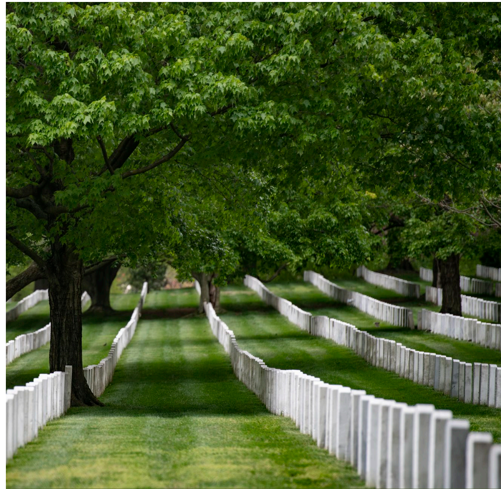
Section 43 of Arlington National Cemetery in 2020.

Other rain garden plants include Swamp Milkweed ( Asclepias incarnata ), Blue-eyed grass ( Sisyrinchium ), Blazing Star ( Liatris spicata ), Seashore Mallow ( Kosteletzkya virginica ), Orange Coneflower ( Rudbeckia fulgida ), River Birch ( Betula nigra ), Buttonbush ( Cephalanthus occidentalis ).