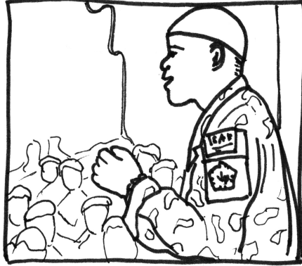
Lead worship services.