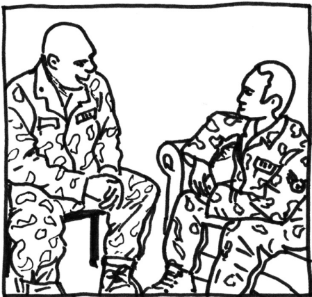
Provide counseling, support, and advice.