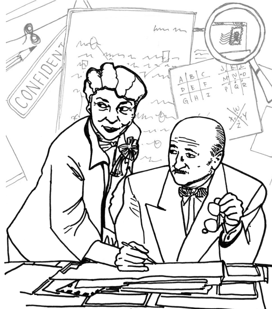
Elizebeth and William Friedman, famous cryptanalysts who broke codes for the United States during World War I and World War II. They are buried in Section 8.