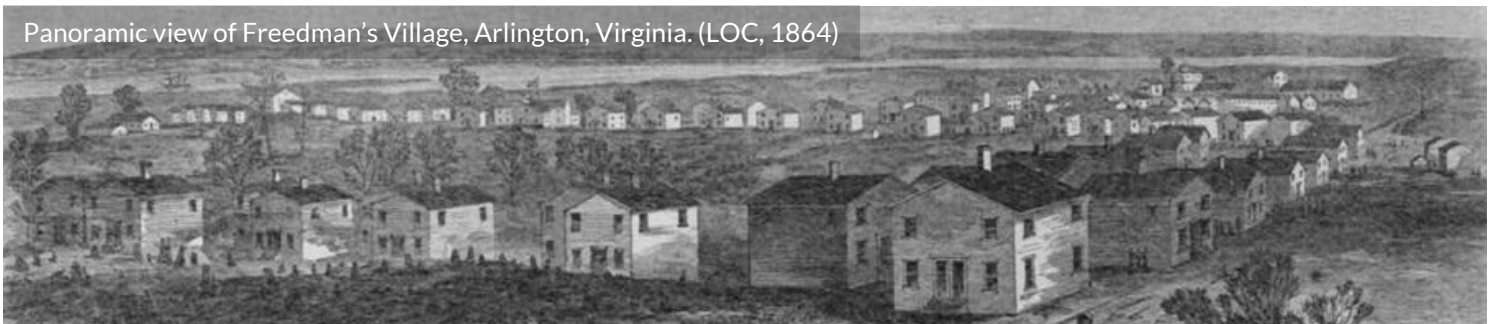
Panoramic view of Freedman's Village, Arlington, Virginia. (1864)